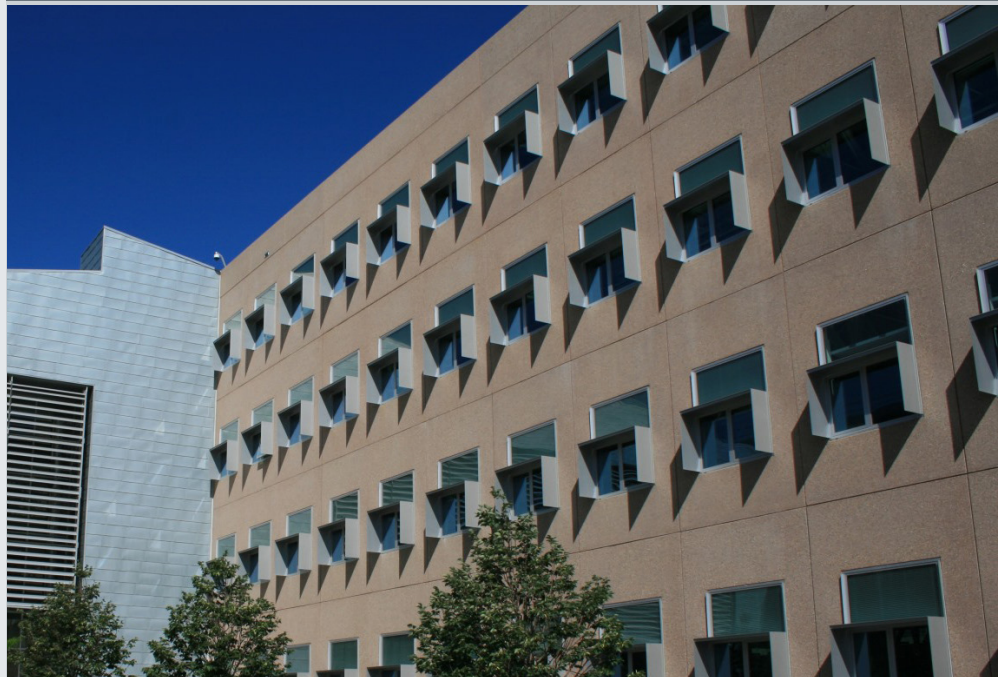
NREL Research Support Facility, photo credit: Bill Gillies, NREL

Prepared for the U.S. Department of Energy by The National Institute of Building Sciences