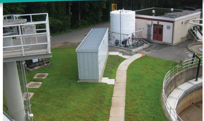
The WRRF in Ridgewood, NJ began receiving fats in 2013 for biogas production at the facility. The original 10,000-gallon capacity was expanded to 30,000 gallons.

The Water Environment Research Foundation (WERF), with collaboration by the New York State Energy Research and Development Authority (NYSERDA), is advancing knowledge and implementation of energy-efficient best practices in the industry, moving WRRFs closer to achieving energy neutrality. Energy neutrality for the domestic wastewater industry is within reach. This research contributes greatly to the industry's understanding of the complexities, opportunities, and challenges that WRRFs face as they strive for energy neutrality. This research sought to aid WRRFs in moving toward "net-zero" energy use through near-at-hand practices and technologies in the areas of energy conservation, demand reduction, and enhanced production.