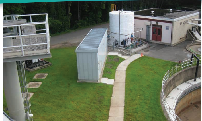
The WRRF in Ridgewood, NJ began receiving fats in 2013 for biogas production at the facility. The original 10,000-gallon capacity was expanded to 30,000 gallons.

The Water Environment Research Foundation (WERF), with collaboration by the New York State Energy Research and Development Authority (NYSERDA), is advancing knowledge and implementation of energy-efficient best practices in the industry, moving WRRFs closer to achieving energy neutrality. Energy neutrality for the domestic wastewater industry is within reach. This research contributes greatly to the industry's understanding of the complexities, opportunities, and challenges that WRRFs face as they strive for energy neutrality. This research sought to aid WRRFs in moving toward "net-zero" energy use through near-at-hand practices and technologies in the areas of energy conservation, demand reduction, and enhanced production.